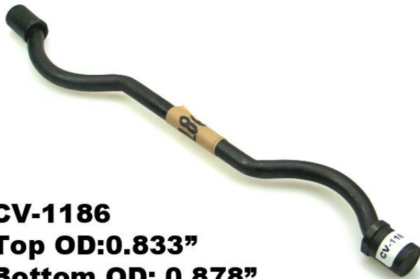
CV-1186 Top OD:0.833" Bottom OD: 0.878" Ref No.:86-3016-0