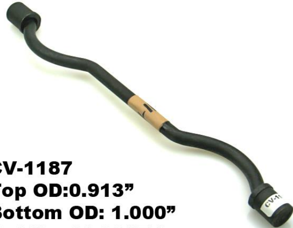
CV-1187 Top OD:0.913" Bottom OD: 1.000" Ref No.:86-3017-0